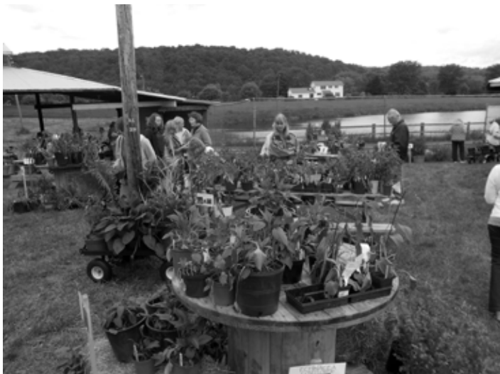
Annual Plant Exchange and Marketplace now at the Clifford Township Fire Company Picnic Grounds

The 9 th Annual Plant Exchange & Marketplace will be held on Sunday, June 2, 2013. This annual event, originally held at garden club members' homes, changed its venue in 2012 to the Clifford Fire Company Picnic Grounds and was deemed a success. In addition to having perennials for exchange and sale, there were over twenty vendors including paintings and photography, candles, syrup, jewelry, birdhouses, garden statuary and gadgets, shrubs, baskets, doll clothes and refreshments. Watch for details of the 2013 event in newspapers and other news media in the spring.