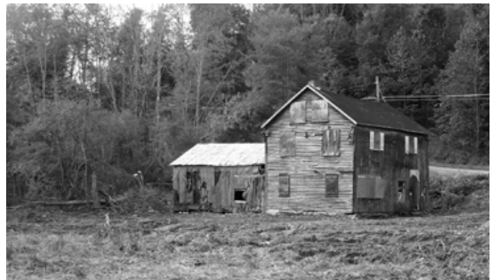
Yarn's Cider Mill before and after efforts by the Clifford Historical Society and many community volunteers.